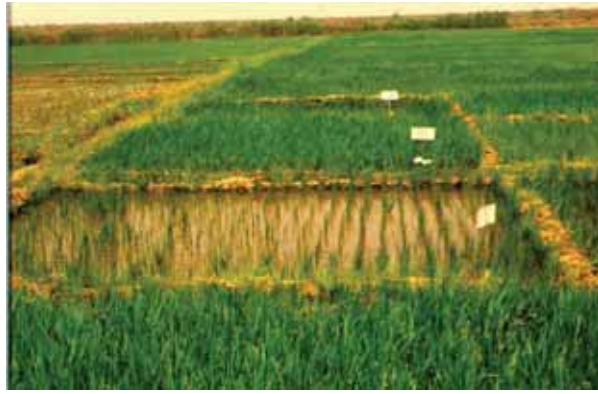
Photo 14.2. Symptoms of phosphorus deficiency