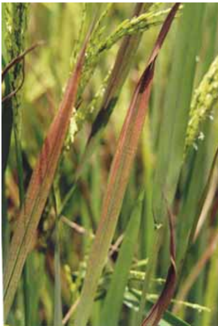
Photo 4.1. Symptoms of iron toxicity on leaves