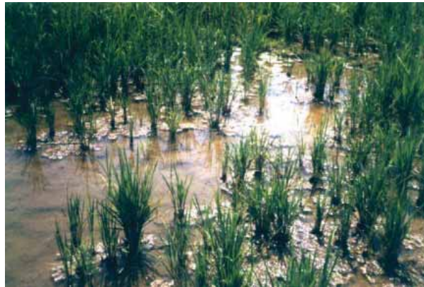
Photo 14.4. Symptoms of zinc deficiency