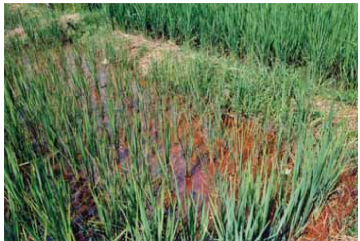
Photo 4.2. Symptoms of iron toxicity in the field