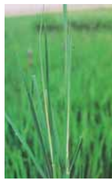
Photo 22.6. Symptom of the African rice gall midge on the plant (onion leaf)