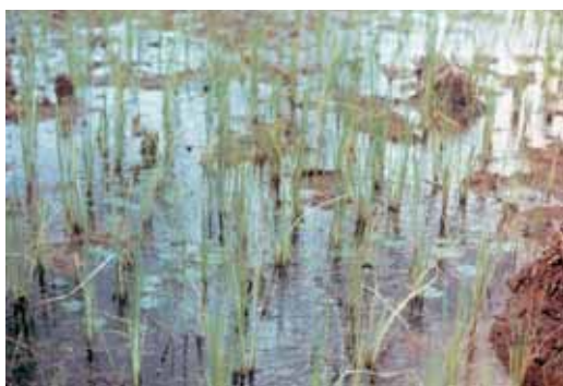
Photo 22.5. Symptoms of the African rice gall midge in the field