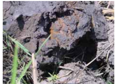
Photo 4.3. Oxidised iron spots on soil