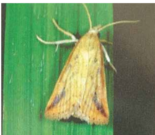
Photo 23.3. Lepidopteran stem borer Chilo zacconius