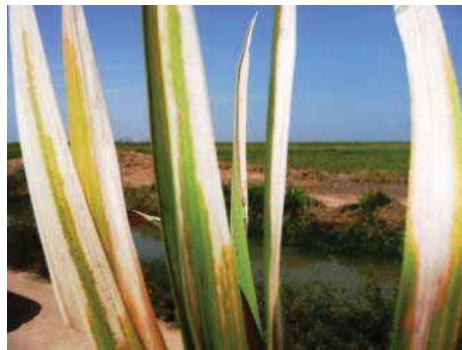
Photo 24.6. Bacterial leaf blight