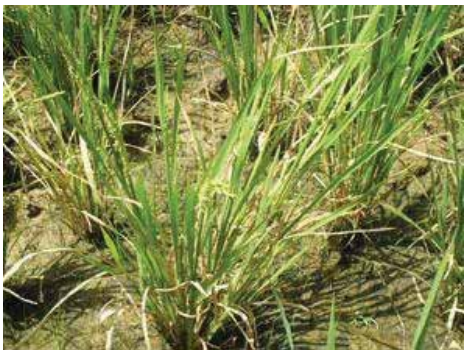
Photo 24.5. Bacterial leaf blight