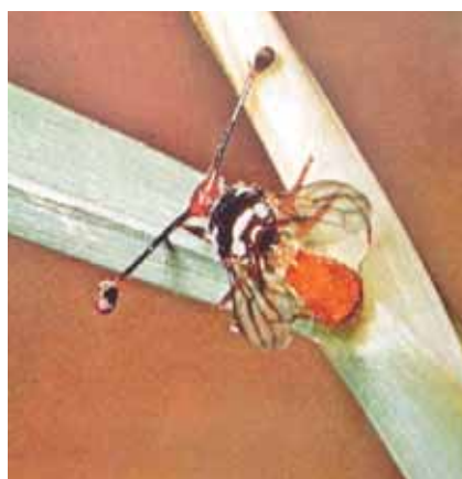
Photo 23.4. Dipteran stem borer Diopsis thoracica