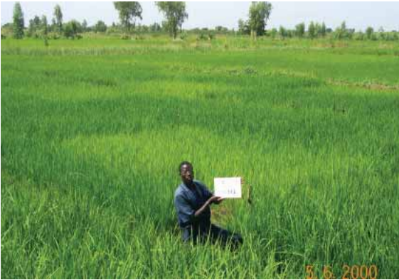
Photo 14.1. Symptoms of nitrogen deficiency