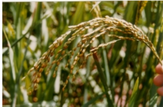
The 'new rice for Africa' is given a high profile by Japanese donors and collaborators alike

In addition, the MFA funds a postdoctoral fellow working with the Interspecific Hybridization Project, Koichi Futakuchi, who is assessing the value of the 'new rice for Africa' in lowland cropping (the plants were originally bred for upland cropping). The traditional African rice ( O. glaberrima ) occurs not only in the uplands, but also in the lowlands, so it is possible to use lowland glaberrimas in the interspecific crosses, with the aim of developing new rice plant types for these systems. Some glaberrimas also have the advantage